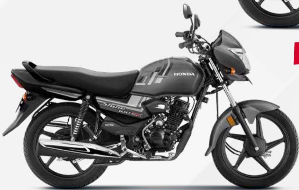
GENY GRAY METALLIC